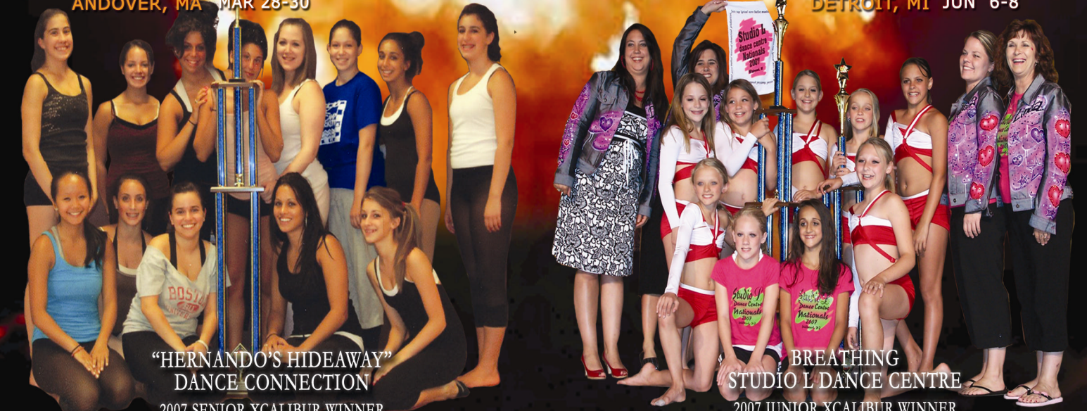
"HERNANDO'S HIDEAWAY" DANCE CONNECTION 2007 SENIOR XCALIBUR WINNER

SPRINGFIELD, MA MAY 2-4 KALAMAZOO, MI MAY 2-4 DES MOINES, IA MAY 2-4 KING OF PRUSSIA, PA MAY 9-11 COLUMBUS, OH MAY 9-11 WEST MILFORD, NJ MAY 9-11 QUEENS, NY MAY 16-18 WOODBRIDGE, VA MAY 16-18 LAS VEGAS, NV PLEASE CALL SPARTA, NJ MAY 30-JUN 1 DETROIT, MI JUN 6-8